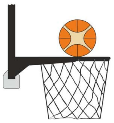
Diagram 2 Ball in contact with the ring

31-15 Statement. Interference is committed by a defensive or offensive player during a shot for a field goal when a player touches the basket or the backboard while the ball is in contact with the ring and still has a possibility to enter the basket.